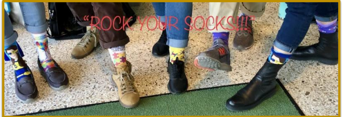
(Above/Right) RITA Staff showing their support for World Down Syndrome Day Thursday March 21.